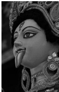
Fig. 06 – Kali

Kali, Hindu goddess of creation, preservation and destruction manifests the fusion of opposites, life, death and rebirth. Positive and negative aspects of creation and in its representation is depicted sticking out her tongue prompting the overcoming of fears not by denying them, but by facing and welcoming them.