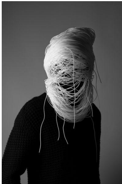
Fig. 03Body –Imagetic exercise 03