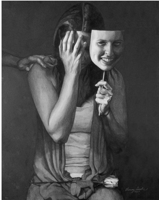
Fig. 02 Body –Imagetic exercise 02