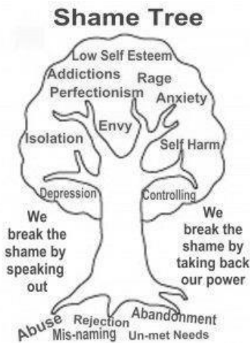
Fig. 04- The tree of shame.